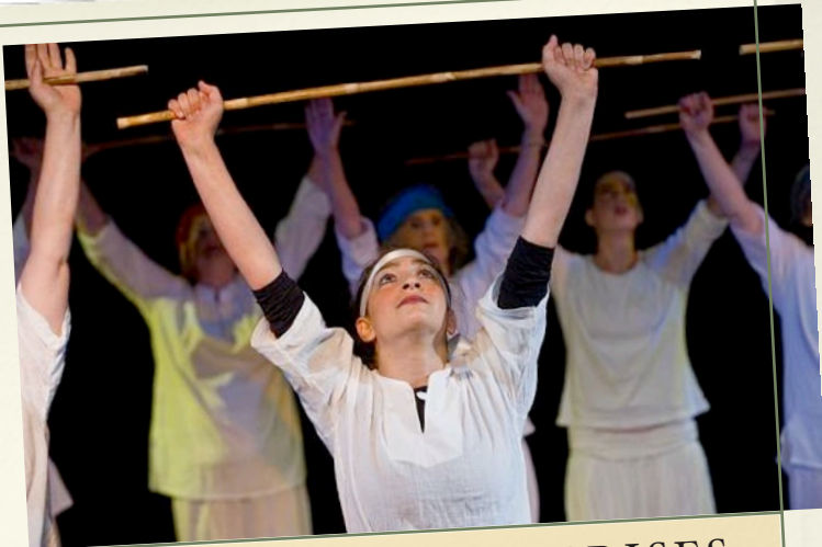
He must rise from the dead

Bring the Word of God to seep into your bones