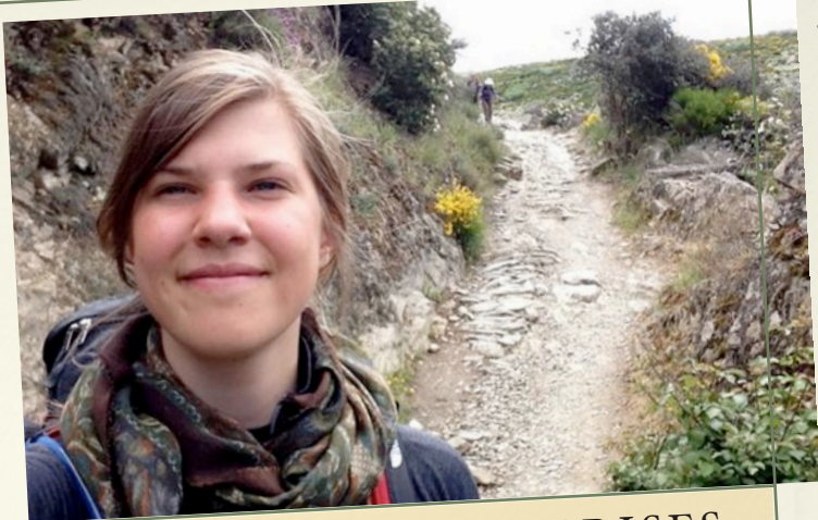
He shares our bread and our fish

Bring the Word of God to seep into your bones