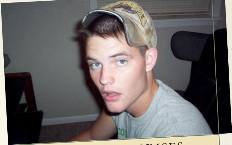
Come Holy Spirit

PENTECOST SURPRISES HOLY SPIRIT COME TO US