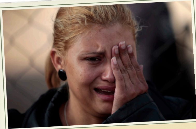
Enter the Year of Faith no. 8

Through faith, we can recognize the face of the risen Lord in those who ask for our love.