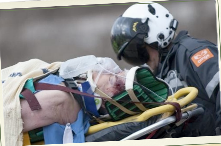
Enter the Year of Faith no.9

The Year of Faith will also be a good opportunity to intensify the witness of charity.