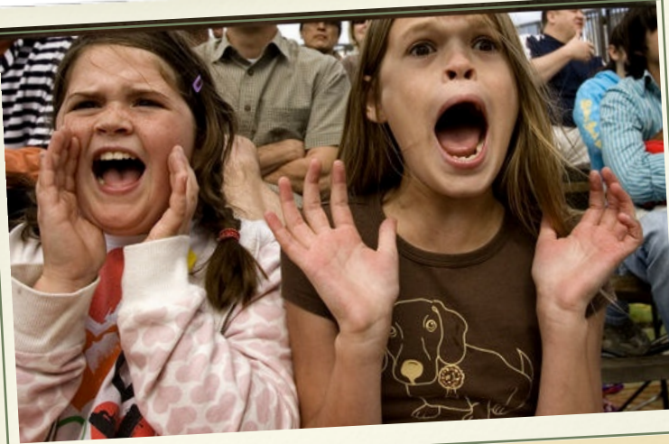
Enter the Year of Faith no. 12

A Christian may never think of belief as a private act.